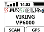
Day - High Contrast